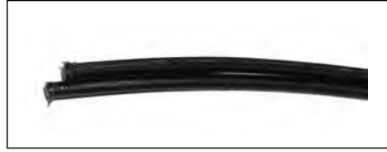
Color Code: Black-TXD, Blue-RXD