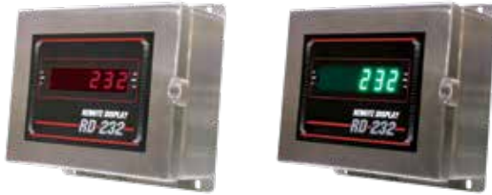
RD-232 NEMA Type 4X Stainless Steel Wall Mount Enclosure