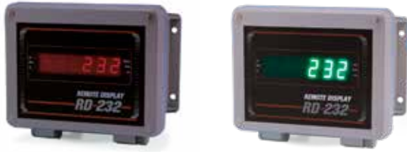
RD-232 NEMA Type 4X FRP Enclosure