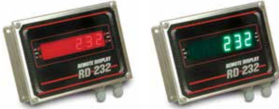
RD-232 Compact Stainless Steel Wall Mount Enclosure