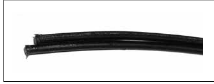
Color Code: Black-TXD, Blue-RXD